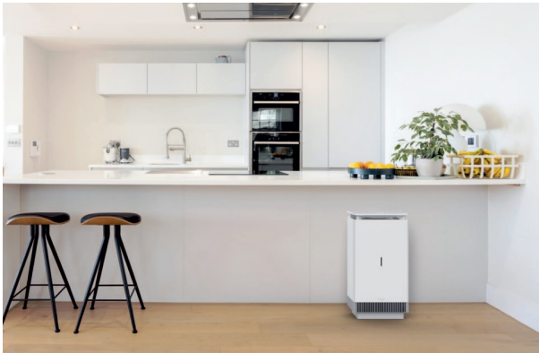
Vitopure purifier in the kitchen

Exceptional capacity: 250, 350, 450 m 3 /h