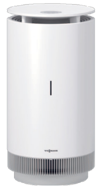
Vitopure 350 m 3 /h