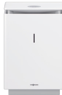
Vitopure 250 m 3 /h