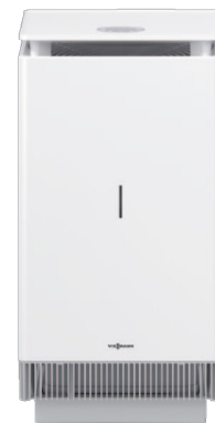
Vitopure 450 m 3 /h