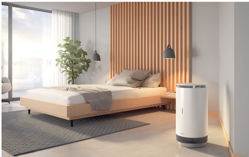
Using Viessmann Vitopure air purifier in the bedroom

Device available on sale only in the Viessmann online store: www.sklep-viessmann.pl