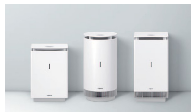
Vitopure purifiers in "white linen" color