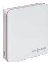
"ViCare thermostat for greater convenience and operational efficiency