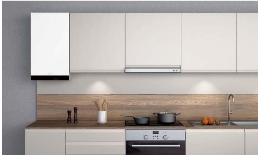
The attractively designed Vitodens 050-W in Vitopearlwhite

Compact and efficient wall-mounted condensing gas boilers with a particularly attractive price/value ratio.