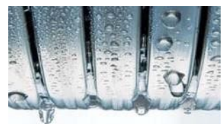
Stainless steel radial heat exchanger

Stainless steel is crucial. "The key element of Vitodens 050-W is the corrosion-resistant stainless steel radial heat exchanger. It efficiently converts used energy into heat. And this is backed up by the safety that comes from the extremely robust, high-quality stainless steel.