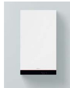
VITODENS 050-W (type B0KA)

"Vitodens 050-W has been tested and approved for operation with natural gas in accordance with EN 15502. No switching between gas groups E/LL/Lw/K is required.